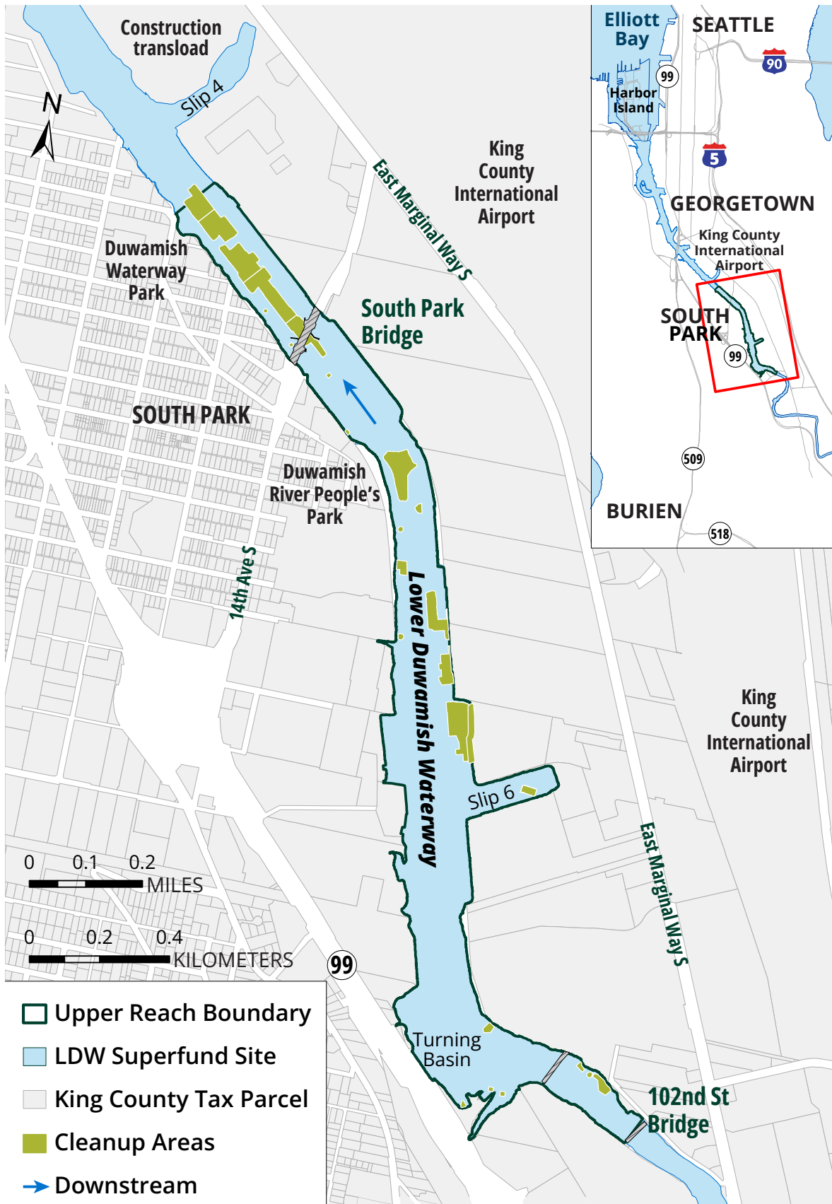
The upper reach is the southernmost two miles of the Lower Duwamish Waterway Superfund site, between Duwamish Waterway Park and the South 102nd Street Bridge.